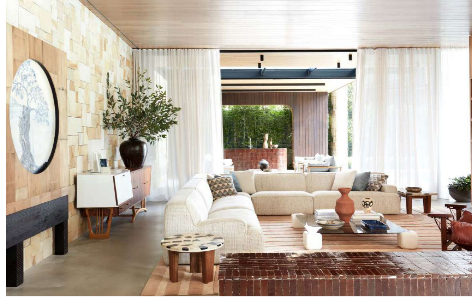
This page, from top In the TV room, vintage buffet in Formica with white module by Giuseppe Scapinelli from Vampt Vintage Design with large wine jar from Orient House. 'Rilievo' rug from Tigmi Trading. 'Big Easy' sofa from Molmic in Elliott Clarke Alhambra 'Faros' fabric. Vintage terrazzo round side and triangle side tables from Rudi Rocket. Tavolo Morbido coffee table from Studio Mignone with Monique Robinson vessel from Saint Cloche, Ryo Kodomari vase from The DEA Store, vintage Japanese bowl from Rudi Rocket and vintage rectangle blue plate from Planet. Jean Gillon 'Captain's chair' from Colecta Rara. Large Sung pot with plant from Orient House. On the terrace, 'Tibbo' three-seater sofa and armchairs from Cosh Living. Tue Poulsen vintage coffee table from Studio Hacienda. Zulu black pot from Orient House. Olive-green bowl, vintage bowl and tall vases on bar from Rudi Rocket. Raku bowl from The DEA Store. Bar tiled in Arabian Coco brick tiles from Perini. Floral from September Studio. Opposite page Artwork by Joshua Yeldham from Scott Livesey Galleries. 'Big Kick' pendant light in blackened brass from Volker Haug. 'Double Bell' dining table from The Wood Room. Afra and Tobia Scarpa 'Monk' chairs from Castorina. Issy Parker platter from The DEA Store. Vintage jug and three-piece Danish ceramic wall hanging from Rudi Rocket. 'Costela' chair from Stylecraft.